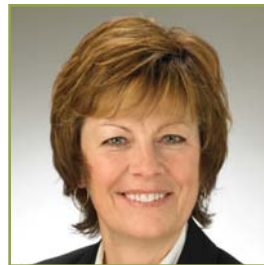
Alanna Koch, Deputy Minister, Ministry of Agriculture, Government of Saskatchewan