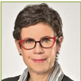
Louise Greenberg, Ph.D, Deputy Minister, Ministry of Advanced Education, Government of Saskatchewan